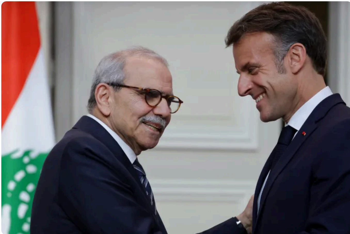
France's President Emmanuel Macron, right, shakes hands with Lebanon's Prime Minister Nawaf Salam at the end of a joint declaration media event at the Elysee Palace in Paris on Tuesday