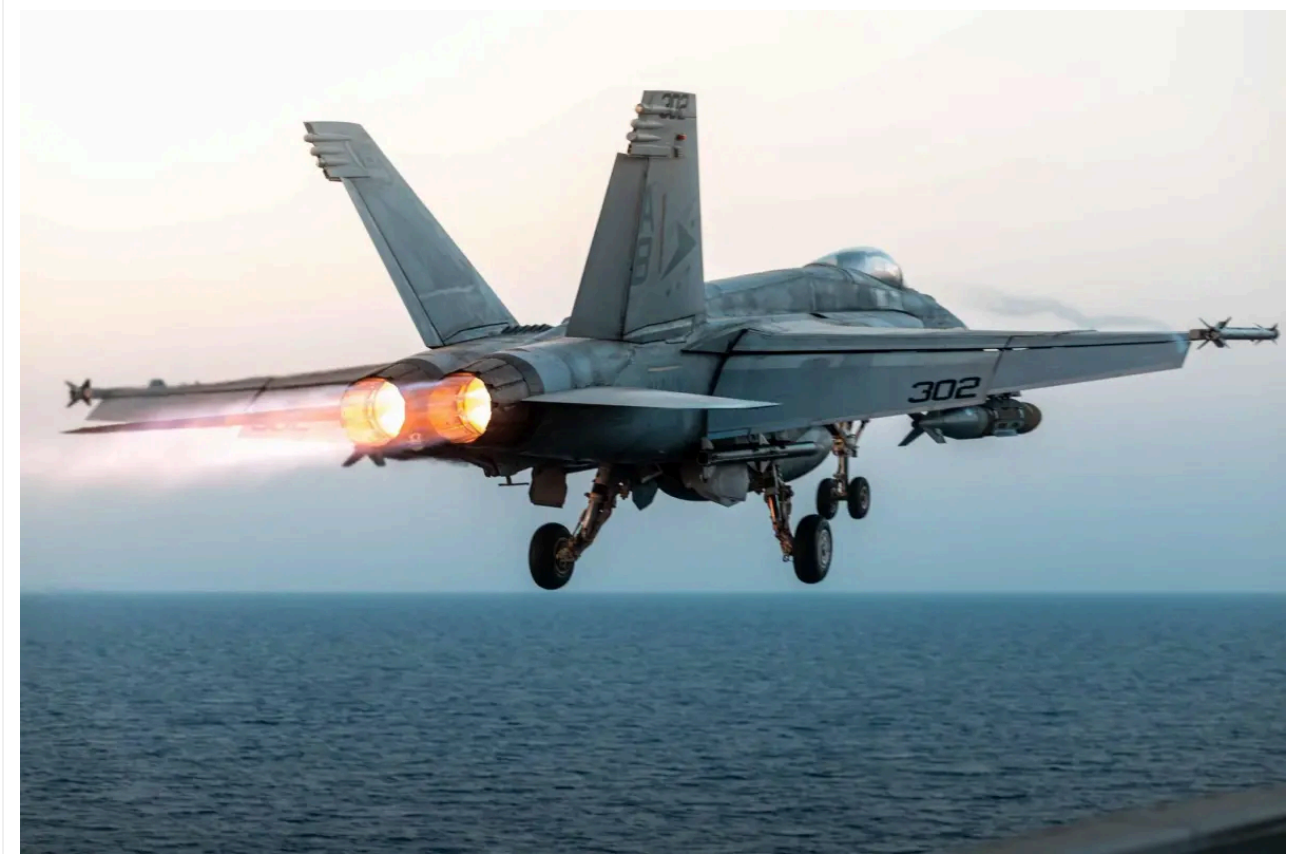
Aircraft assigned to Carrier Air Wing (CVW) 1 launches from the flight deck of the Nimitz-class aircraft carrier USS Harry S. Truman (CVN 75) during flight operations in the U.S. Central Command area of responsibility, posted March 26, 2025, on U.S. Central Command’s X account.

When the Trump administration took office in January 2025, it quickly signaled that it was going to “eliminate the Houthis’ capabilities and operations, deprive them of resources, and thereby end their attacks on U.S. personnel and civilians, U.S. partners, and maritime shipping in the Red Sea.” 23 Or as Secretary of Defense Pete Hegseth later put it in the now infamous Signal chat, the Trump administration wanted to do two things: “restore freedom of navigation and re-establish deterrence.” 24 In an effort to accomplish those goals, the United States launched Operation Rough Rider on March 15, 2025.