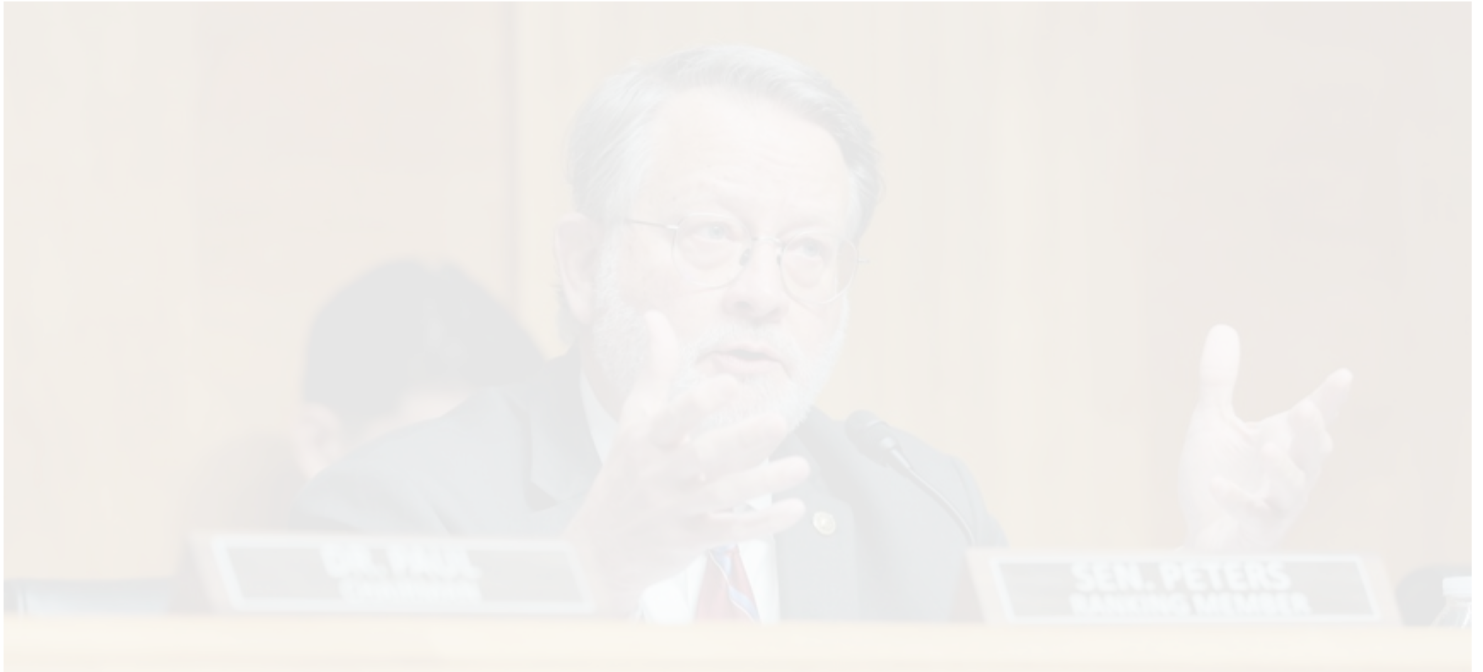
Sen. Gary Peters, D-Mich., speaks during a hearing on Capitol Hill on May 20, 2025. He argued in a press call that President Donald Trump has created "an environment of intimidation that makes it difficult for" inspectors general to perform their roles.

[SPONSORED] Efficient Cyber Risk Management Starts with a Risk CONTINUE TO THE SITE IN 7 →