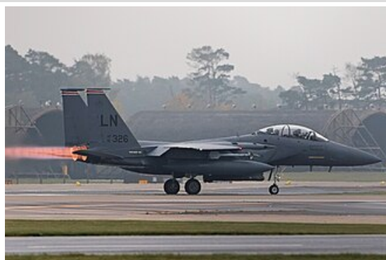
An F-15E Strike Eagle of the 494th Fighter Squadron, similar to the aircraft shot down