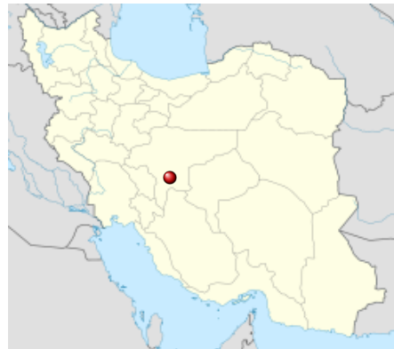
Location of U.S. aircraft wreckage