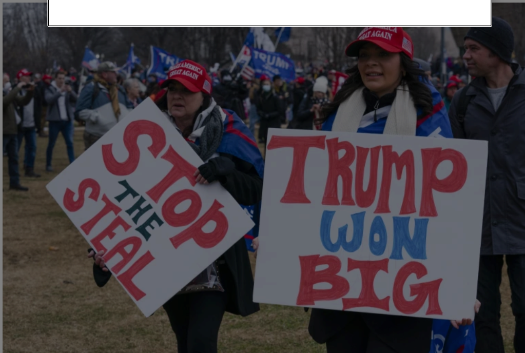
Supporters of President Donald Trump gather for a rally on Jan. 6, 2021, at the Ellipse near the White House in Washington. Read More

Many Republicans are willfully ignoring the issue, especially in Congress, despite lawmakers having run for their lives and taken shelter as the rioters stormed the Senate chamber and ransacked Capitol offices.