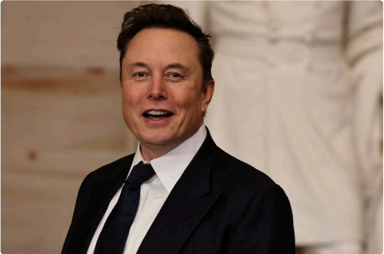
Tesla, SpaceX and X CEO Elon Musk arrives for the Inauguration of Donald J. Trump in the U.S. Capitol Rotunda, Jan. 20, 2025 in Washington.