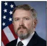
Thomas Massie (KY)