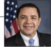
Henry Cuellar (TX)