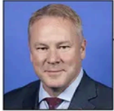
Warren Davidson (OH)