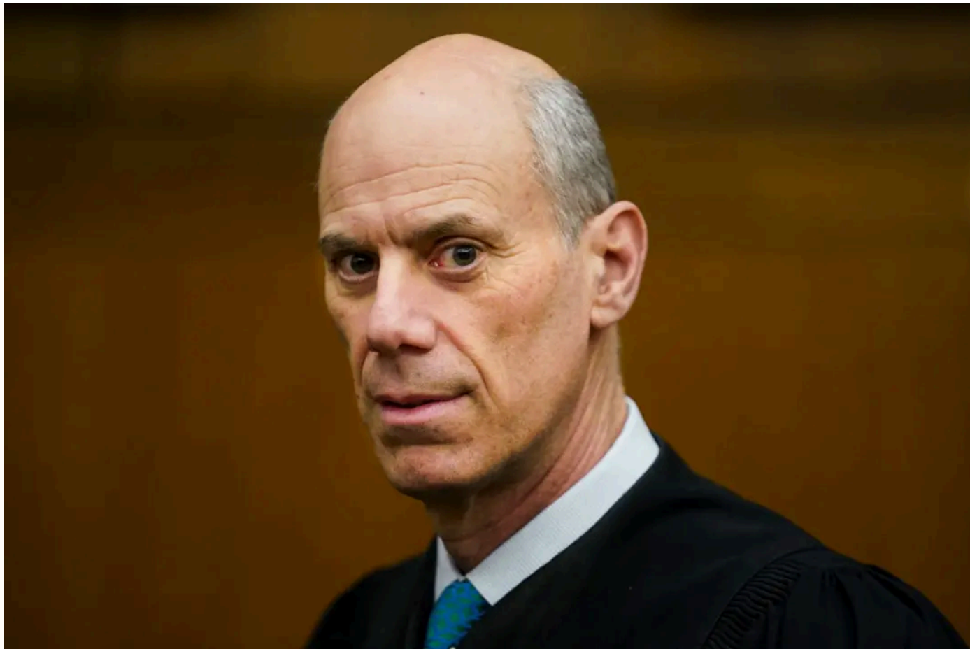
James Boasberg, District Judge in Washington, D.C., on March 16, 2025.