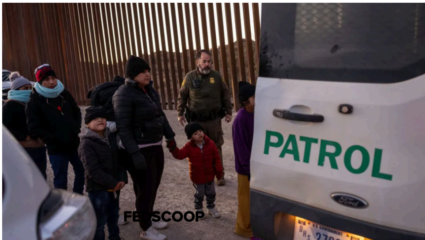
U.S. Border Patrol agents watch over immigrants next to the U.S.-Mexico border fence before transporting them for processing on Jan. 19, 2025 near Sasabe, Ariz.