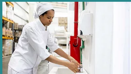
Building a Culture of Hygiene in the Food