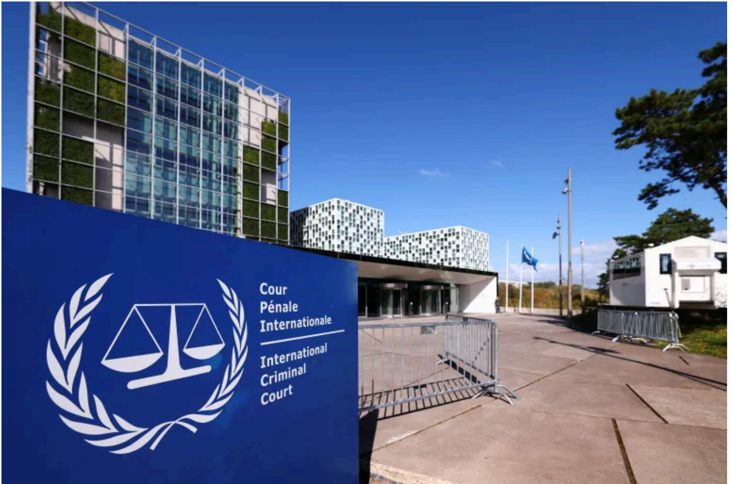
The International Criminal Court (ICC) in The Hague, Netherlands, has warned that US sanctions threaten the 'international legal order'