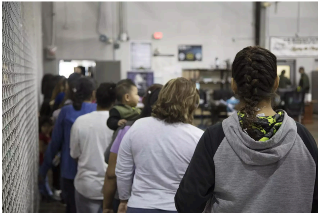
Customs And Border Protection

U.S. Border Patrol agents conduct intake of detained migrants at the Central Processing Center in McAllen, Texas on June 17, 2018.