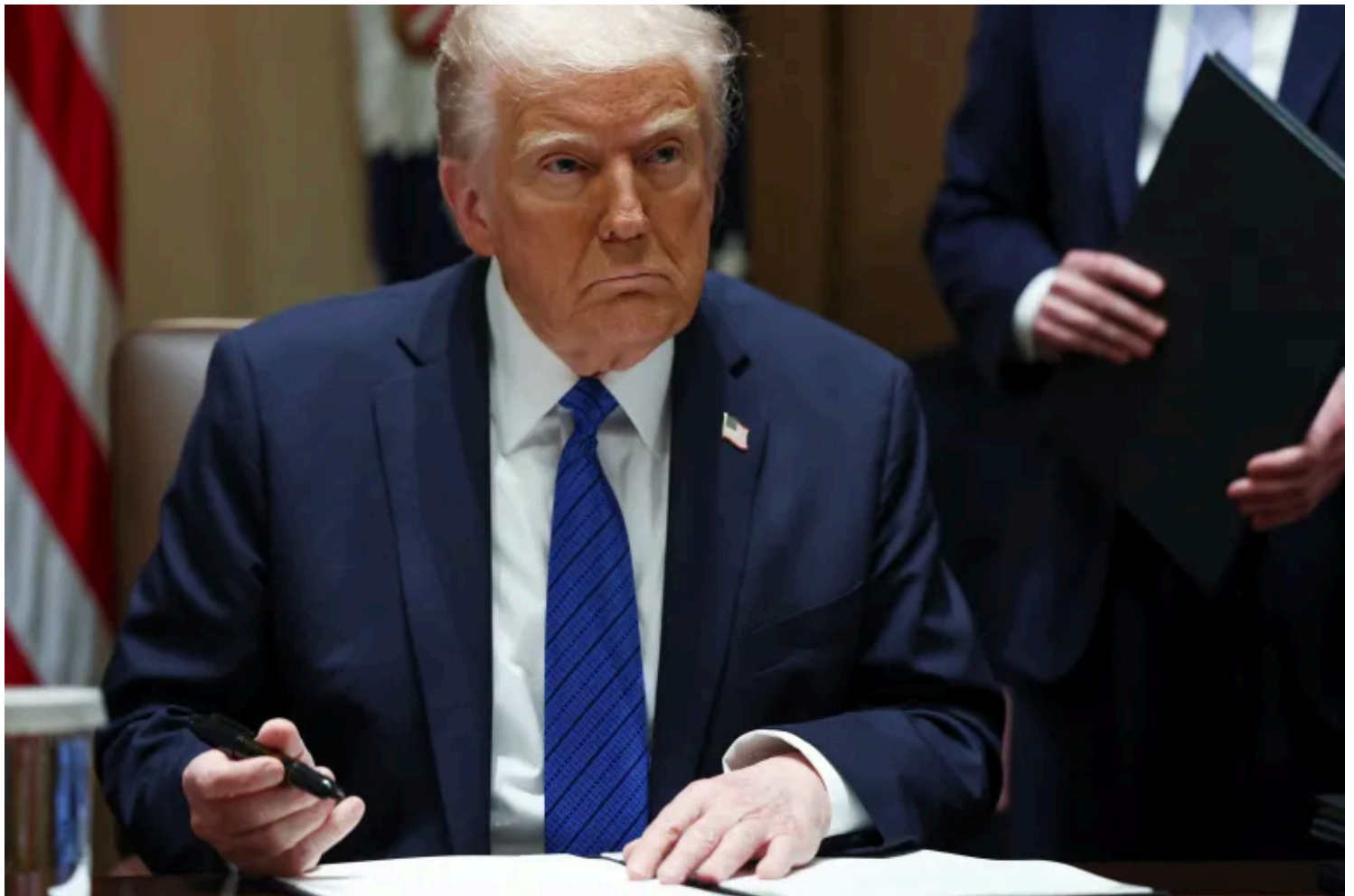
Donald Trump has signed a new executive order titled 'Preserving and Protecting the Integrity of American Elections'