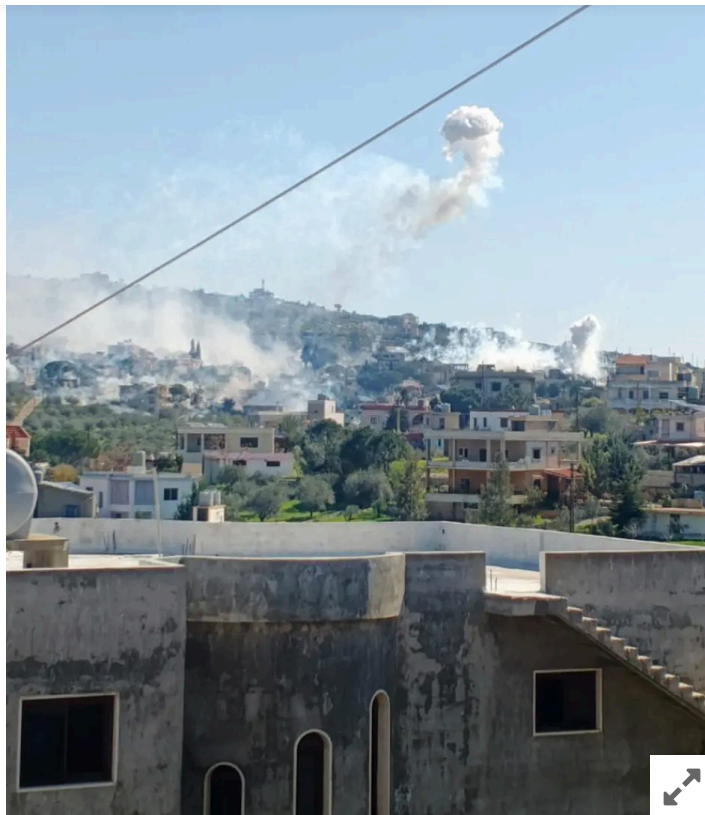
At least two artillery-delivered white phosphorus munitions being airburst over a residential neighborhood in the town of Yohmor, in southern Lebanon, March 3, 2026.

White phosphorus can be used for multiple purposes, including to obscure, mark, signal, or directly attack military personnel and materiel. Concerns over its use in populated areas are amplified by the technique shown in videos of air-bursting white phosphorus projectiles, which spread 116 burning felt wedges impregnated with the substance over an area between 125 and 250 meters in diameter, depending on the altitude and angle of the burst, indiscriminately exposing more civilians and civilian structures to potential harm than a localized ground burst.