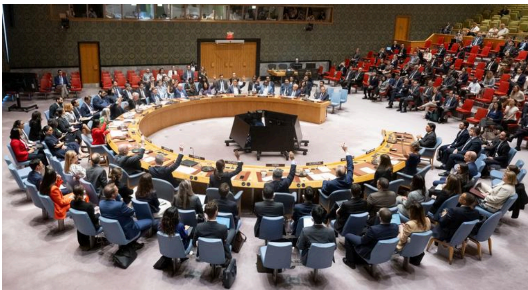
UN Security Council members voting in favour of the draft resolution.