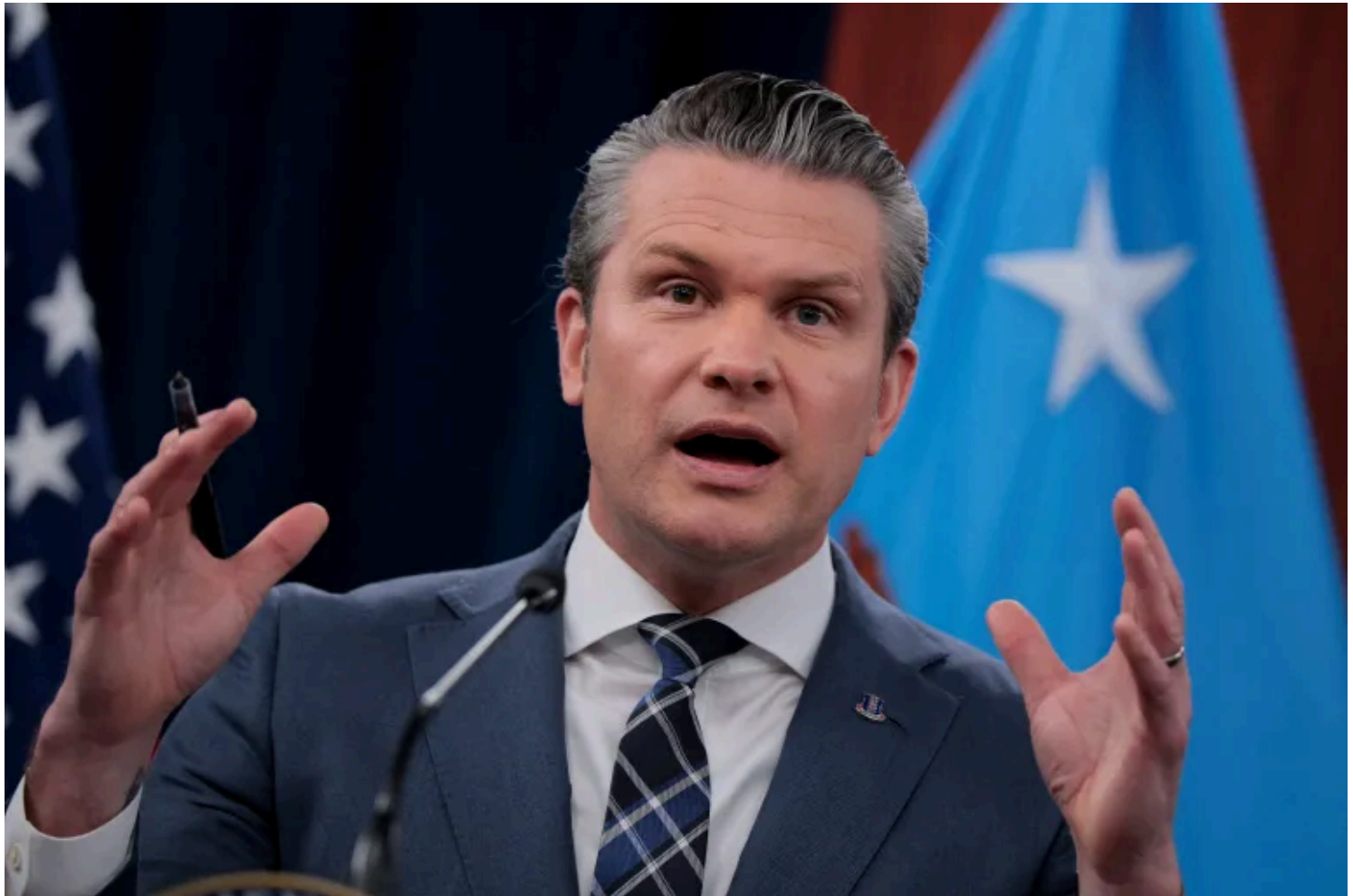
The new arms deal comes as the Pentagon seeks additional funding from Congress