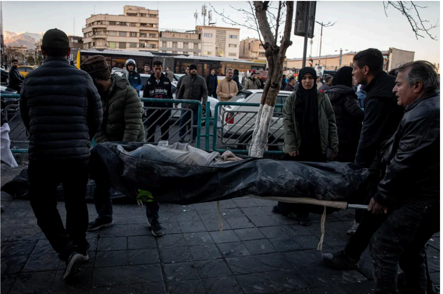
At least 1,230 people killed in Iran, including 175 schoolgirls and staff in a Saturday missile strike on a school in Minab.