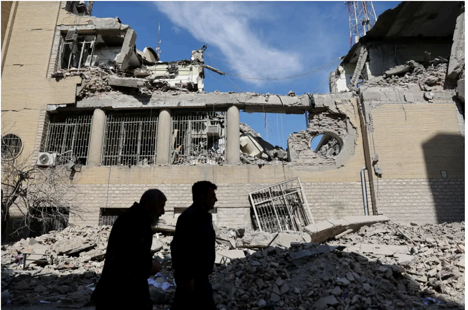
New videos and photos show destruction across Iran after US and Israeli air strikes, including damage to government buildings, residential neighbourhoods and Iran's main sports stadium.