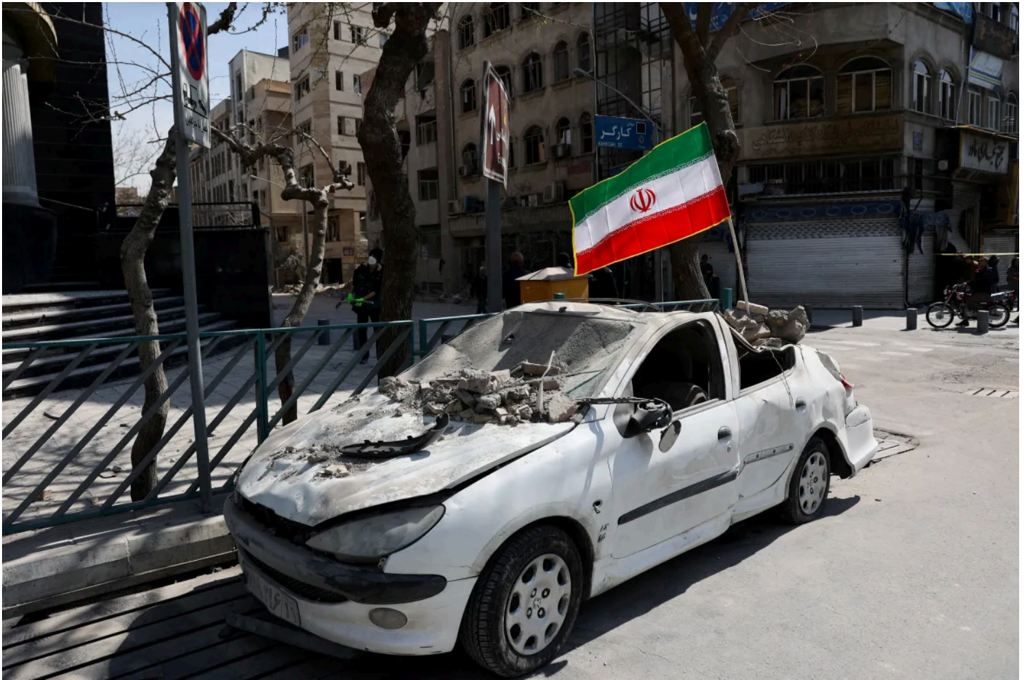
An Iranian flag is mounted on a damaged car following a strike on a police station in Tehran.