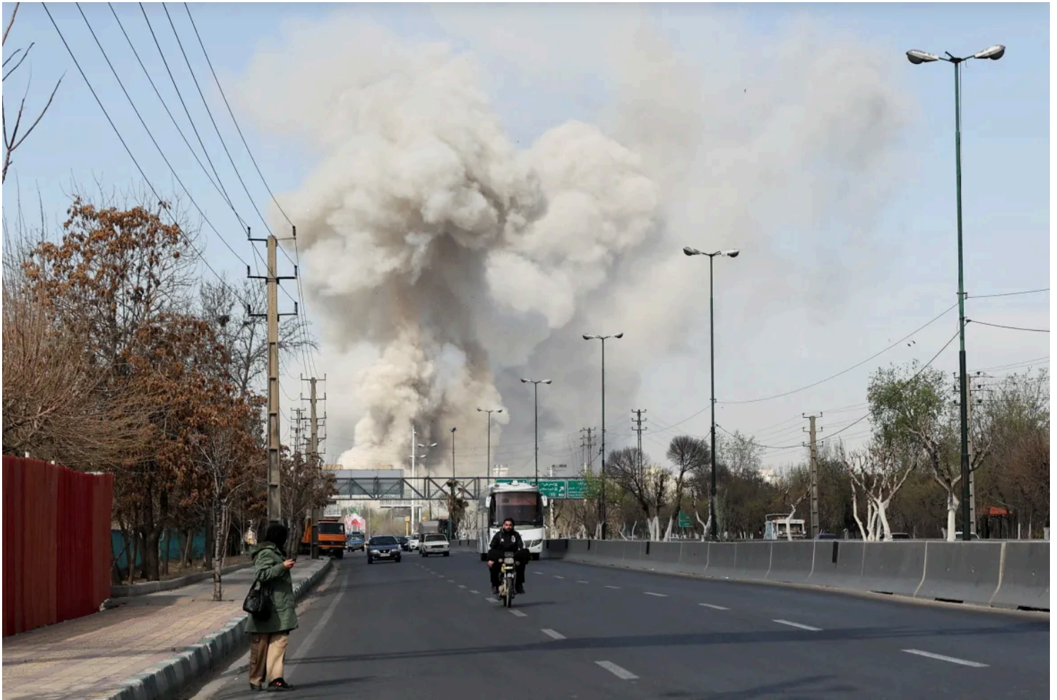
Missiles fired by the US and Israel have hit two schools in the town of Parand, southwest of Tehran, amid ongoing strikes on the country.