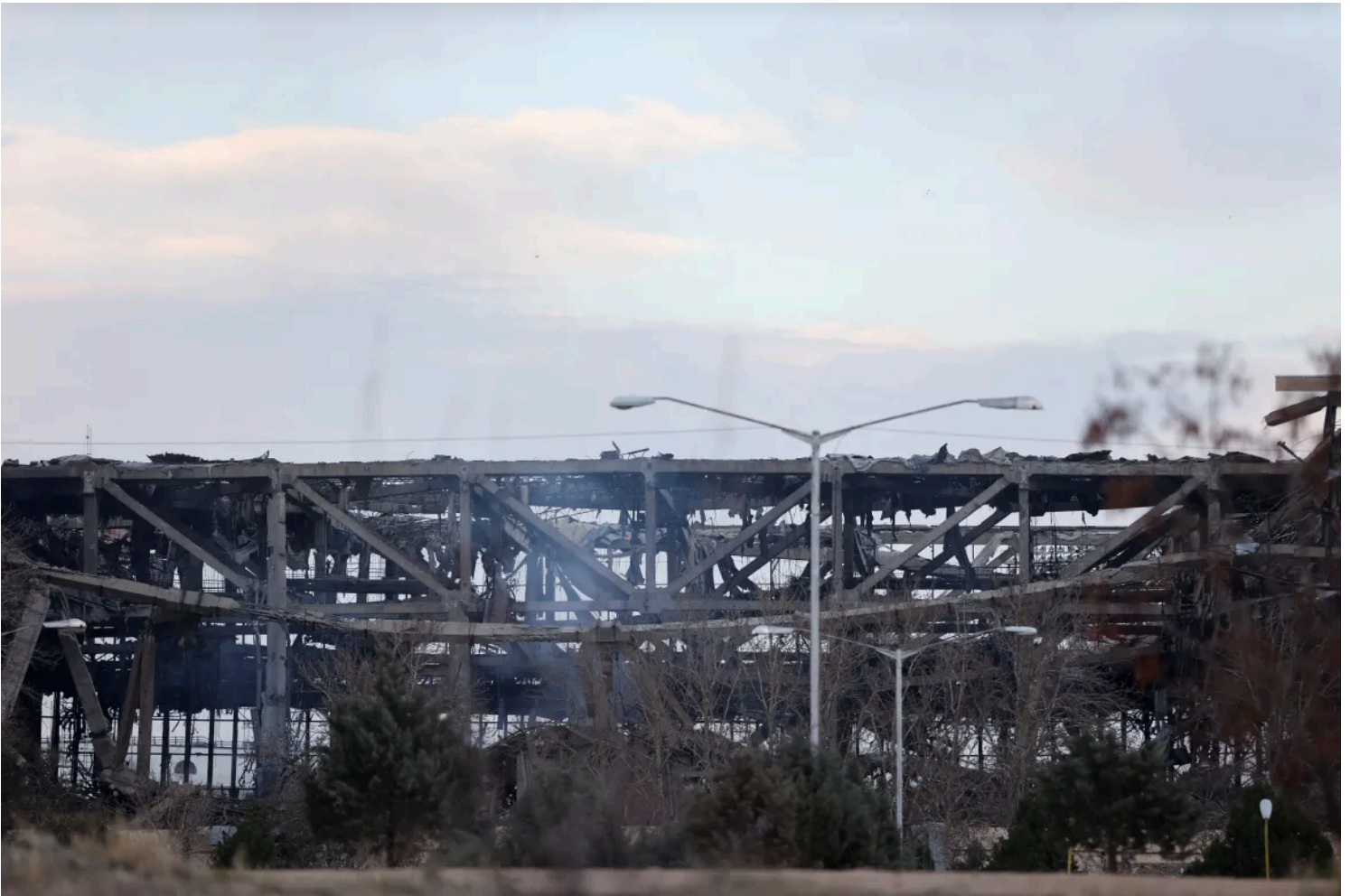
Smoke rises over damaged Azadi Stadium following an US-Israeli attack.