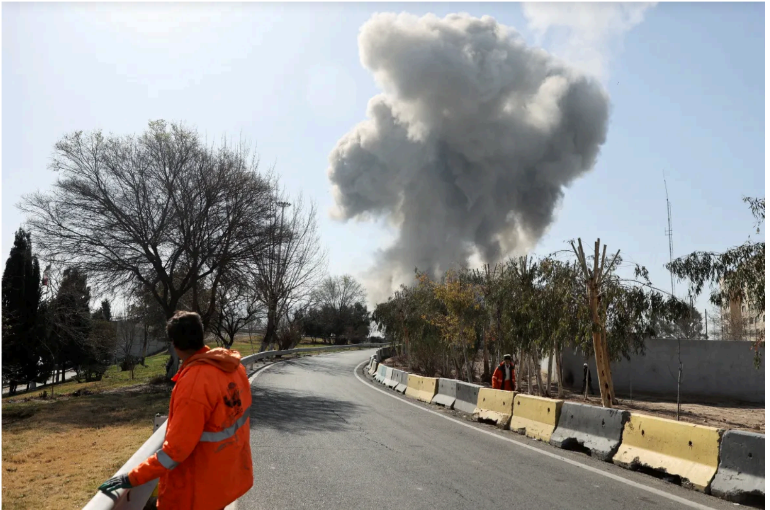
Iranian media say dozens of strikes have hit multiple locations as fears grow of a wider regional conflict.

Get instant alerts and updates based on your interests. Be the first to know when big stories happen.