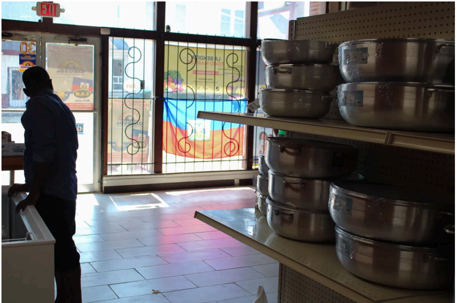
Man in a Haitian-owned store in Ohio.