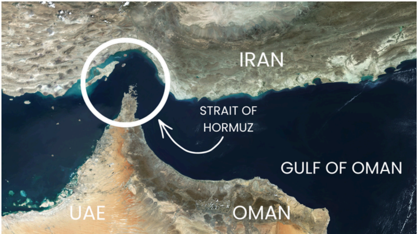
A satellite image shows the Strait of Hormuz, a key maritime passage connecting the Persian Gulf to the Gulf of Oman, vital for global energy supply.

That threat is already rippling through energy markets.