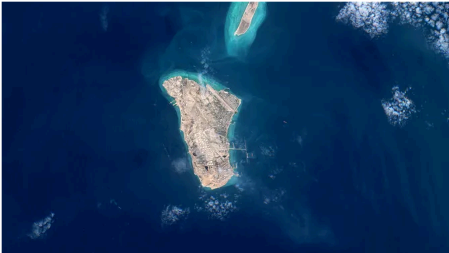
Satellite view of Kharg Island, located in the Persian Gulf off the coast of Iran.

That makes Kharg Island one of Iran's most sensitive and strategically important pieces of infrastructure. Any military action there could have consequences well beyond Iran, raising the risk of disruptions to crude flows, shipping traffic and energy prices across the region.