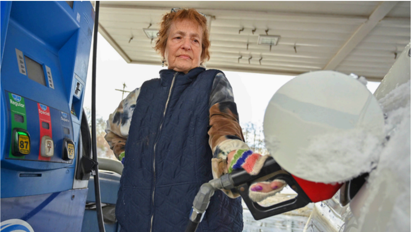
A woman pumps gas at a station in New York as prices climb nationwide due to the ongoing conflict in the Middle East.

As energy costs accelerate, the White House is weighing steps to safeguard commercial shipping through the Strait of Hormuz and leaning on emergency stockpiles to cushion the blow.